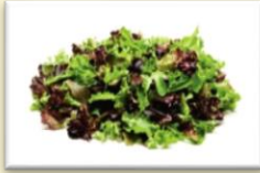
Mesclun Spring Mix Blend