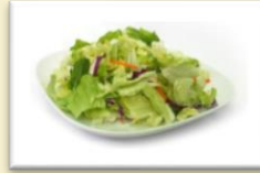
Crisp Iceberg & Red Cabbage