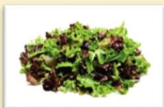
Mesclun Spring Mix Blend