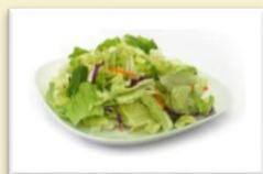
Crisp Iceberg & Red Cabbage